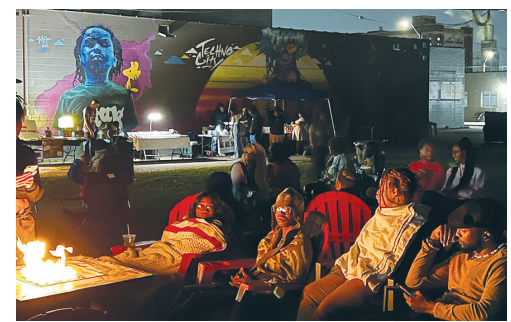
Lyrics & Libation—So Dope