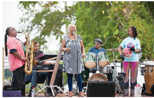
Hug Detroit—Giving Their Best