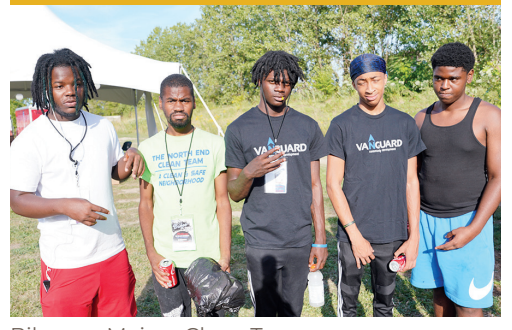
Bikes on Main—Clean Team

A Network of Leaders in Grassroots Economic Development